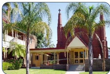
St John the Evangelist Church Dickson Street Lambton Est. 1873