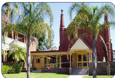
St John the Evangelist Church Dickson Street Lambton Est. 1873