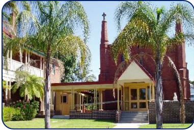
St John the Evangelist Church Dickson Street Lambton Est. 1873