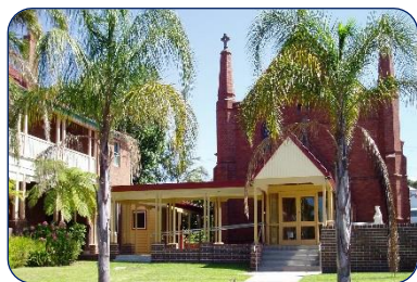
St John the Evangelist Church Dickson Street Lambton Est. 1873