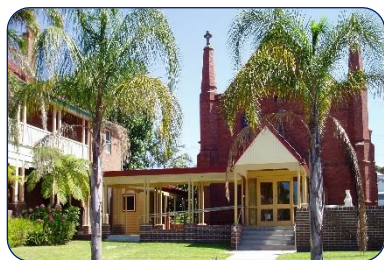
St John the Evangelist Church Dickson Street Lambton Est. 1873