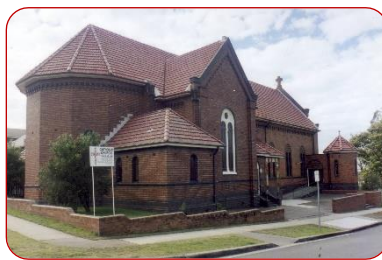
Corpus Christi Church Platt Street Waratah Est. 1917