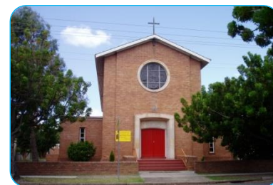
St Therese's Church Royal Street New Lambton Est. 1954