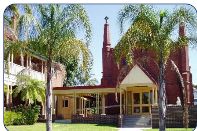
St John the Evangelist Church Dickson Street Lambton Est. 1873