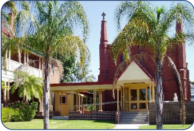
St John the Evangelist Church Dickson Street Lambton Est. 1873