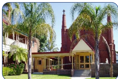
St John the Evangelist Church Dickson Street Lambton Est. 1873