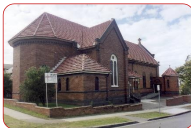
Corpus Christi Church Platt Street Waratah Est. 1917