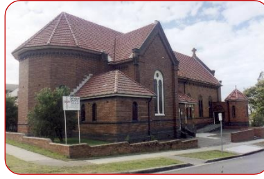
Corpus Christi Church Platt Street Waratah Est. 1917