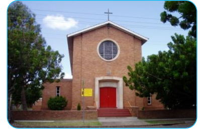
St Therese's Church Royal Street New Lambton Est. 1954

◆ SECOND SUNDAY OF ADVENT ◆ YEAR A ◆ 8 DECEMBER 2019 ◆