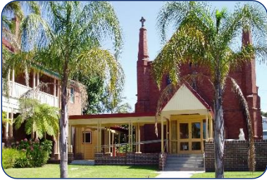
St John the Evangelist Church Dickson Street Lambton Est. 1873