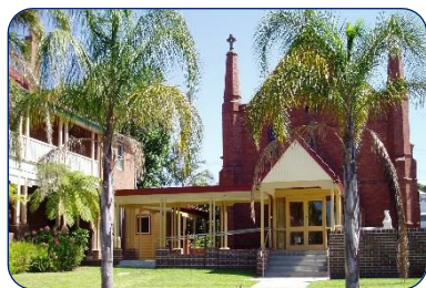
St John the Evangelist Church Dickson Street Lambton Est. 1873